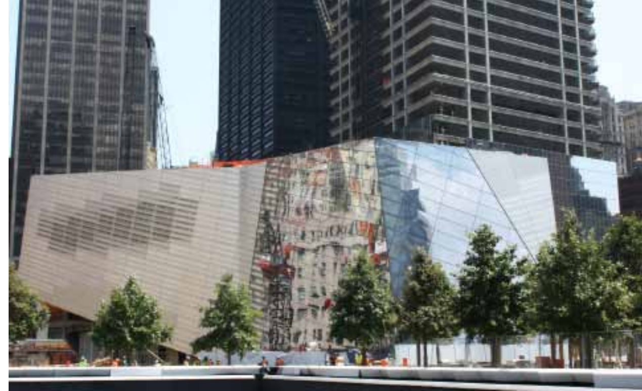
Memorial Pavillion at Ground Zero.

The problem with this mind set is, freedom is a privilege. We can debate whether freedom is basic human right and to what extent this ideal applies, but within the context of a complicated and imperfect world, personal freedom is a privilege, not a guarantee. Instead of stomping our feet and crying at the top of our