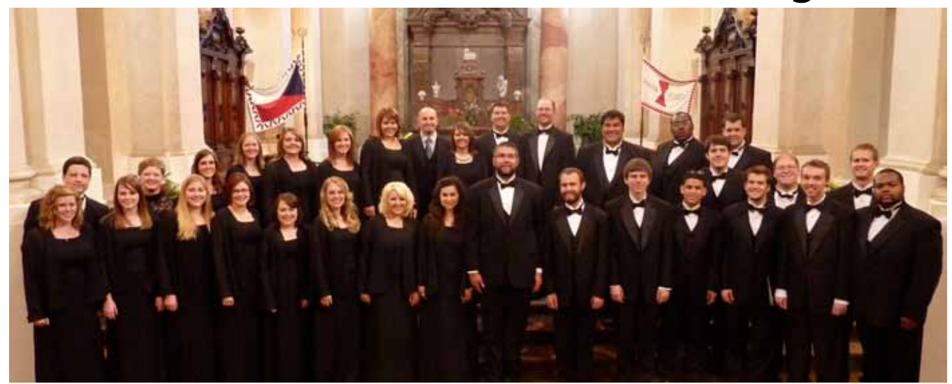
Chorale at St. Nicholas Church in Prague, Czech Republic.