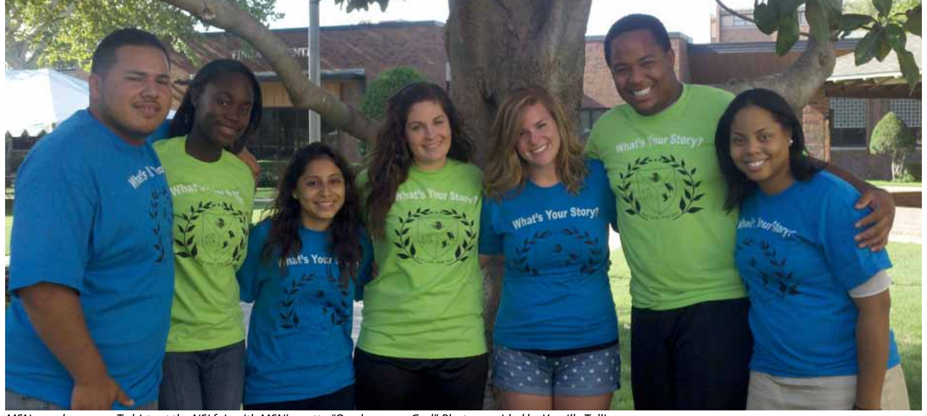
MSN members wore T-shirts at the NSI fair with MSN's motto "One love, one God".